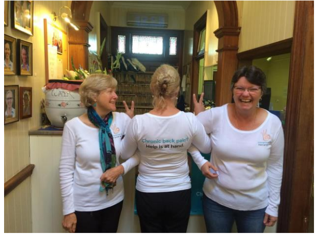
Another great Chiropractic Care Week - Feel Great Again: Help is at Hand